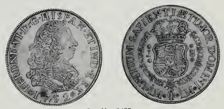
Lot No. 2477

Ferdinand VI, 1746-1760. 8 Escudos, 1752 J. Lima. Obv. Large peruked and armored bust. Rv. Crowned Arms within the Fleece Collar, the motto INITIUM SAPIENTIAE TIMOR DOMINI ("the beginning of wisdom is fear of the lord") around. C-T 18, KM 50. A three year type. Almost Extremely Fine, the obverse choice. Scarce. (2,000-2,500)